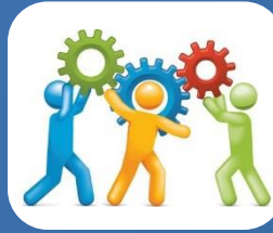
Information management & collaboration framework