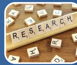
QUT Research & Innovation Strategy