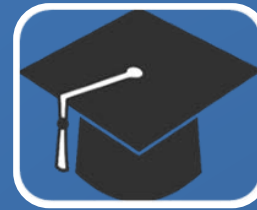
Enhancing the Student Experience initiatives