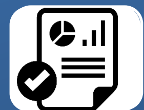
Data to improve performance