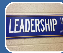
Leadership & management skills