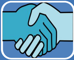
Outreach by Faculty Liaison Teams