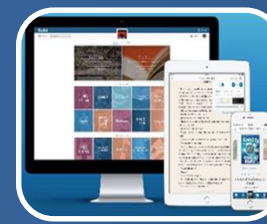
Library Services Platform