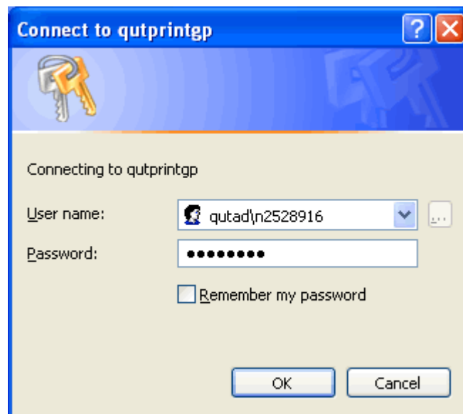
Figure 27 Username and password prompt