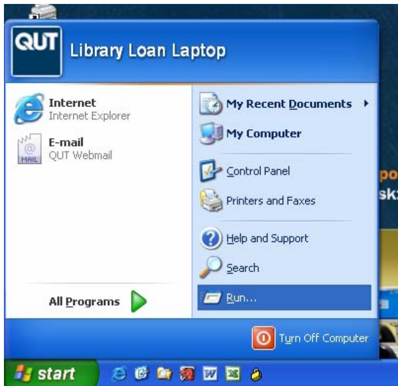
Figure 25 Start menu - Run.