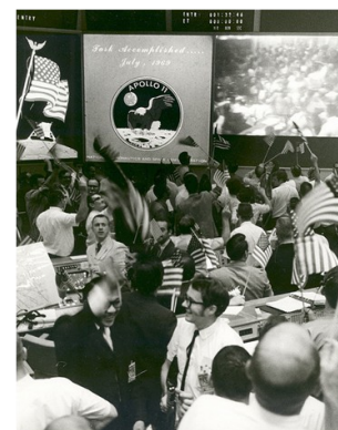
Mission Control Celebrates After Conclusion of the Apollo 11 Lunar

While the image is hosted by Euclid VanderKroew under a Creative Commons license, Euclid is not the right's holder. Luckily he cites the correct NASA document number in the caption and a NASA url, so that a correct citation can be made according to NASA copyright http://grin.bq.nasa.gov/copyright.html . QUT staff wishing to use a NASA image should cite NASA as the originator of the image and abide by